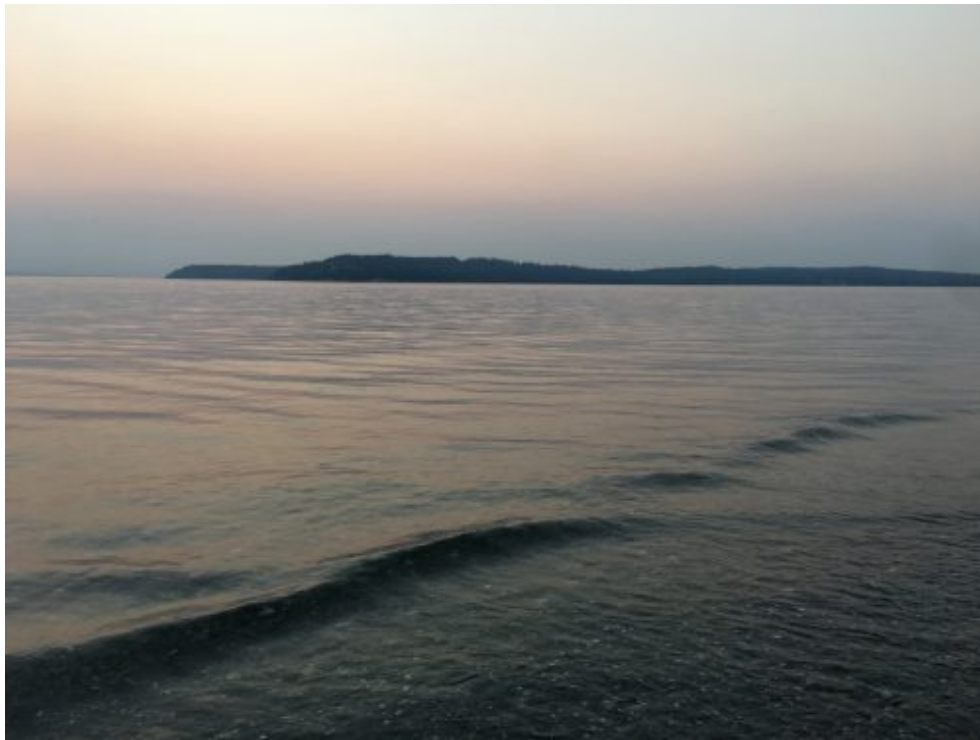
Looking across the sound at Whidbey Island.