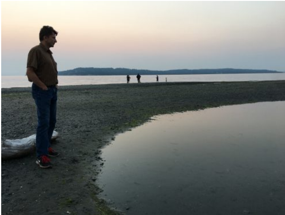
My hubby checking out the tide pools.

We took a ride out to Puget Sound by our house last night. We are getting smoke drifting down from the fires in British Columbia, causing interesting colors in the sky.