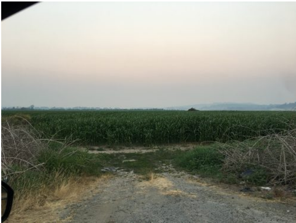
The Cascades are hidden!