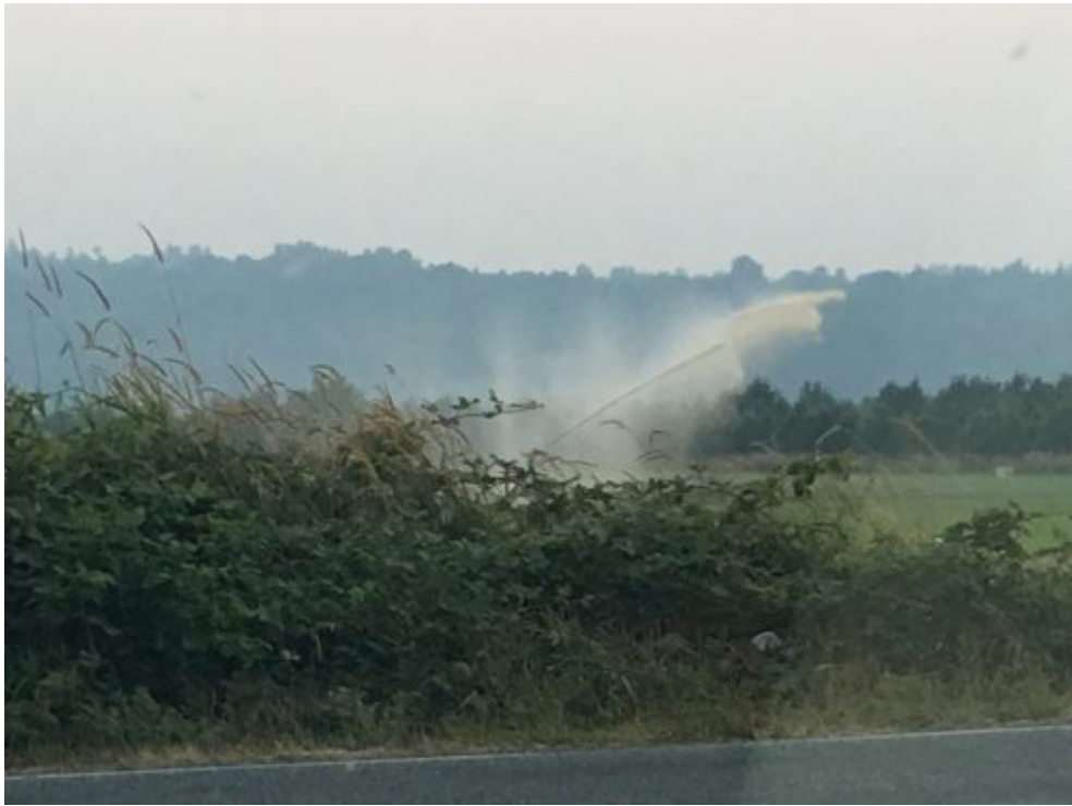
Sprinkler is hitting smoke and looking brown.