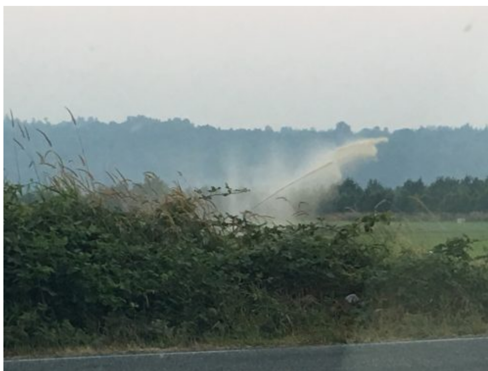
Sprinkler is hitting smoke and looking brown.